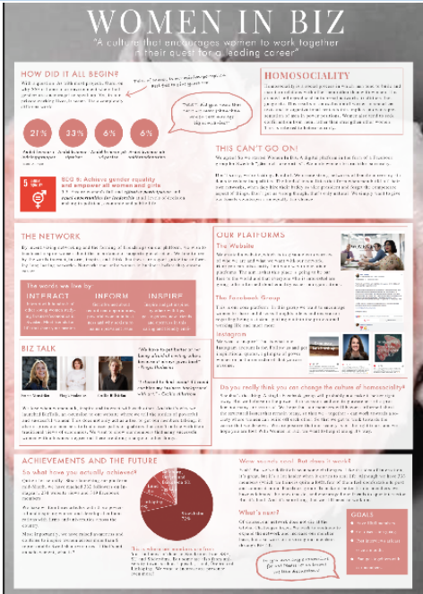
Better quality attached in assignments