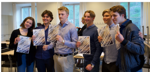
Winning team from Täby Enskilda Gymnasium

The winning team from Täby Enskilda Gymnasium was awarded the Global Solutions Prize